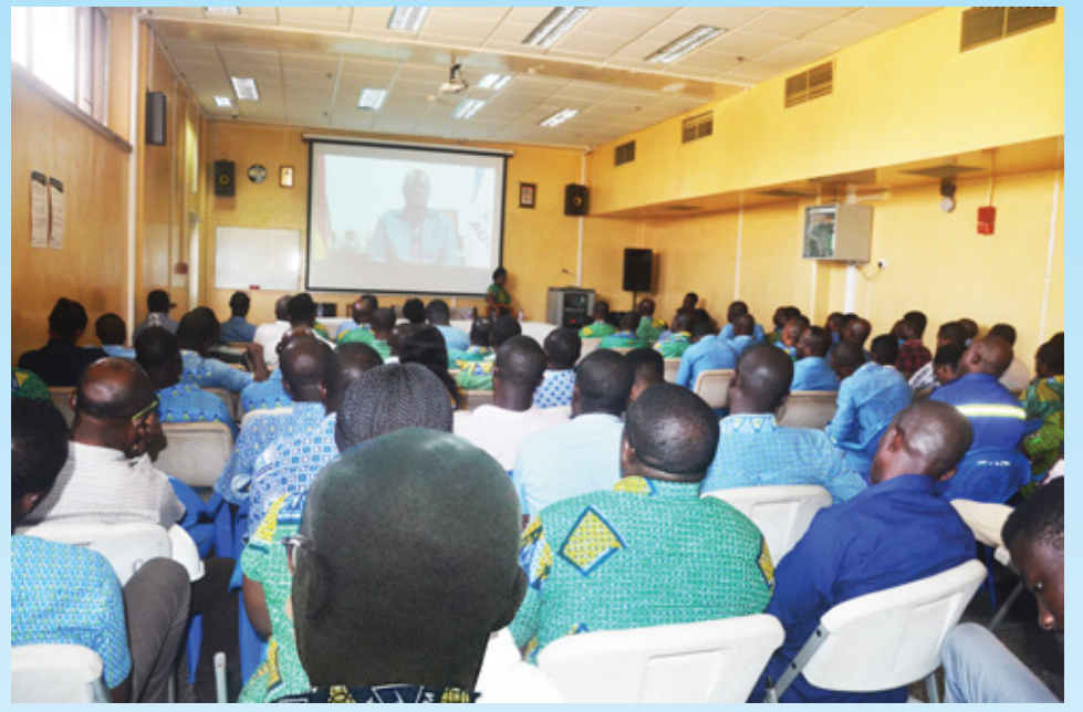
Staff at Aboadze listening to the Chief Executive on VRA Day